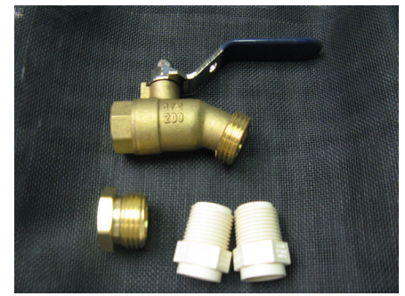
Figure 1. Rain barrel hardware (clockwise from top): a hose bib, two PVC male adapters, and a male garden hose adapter on a square of window screen.